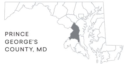
PRINCE GEORGE'S COUNTY, MD

Prince George's Community College (PGCC) creates a significant positive impact on the business community and generates a return on investment to its major stakeholder groups—students, taxpayers, and society. Using a two-pronged approach that involves an economic impact analysis and an investment analysis, this study calculates the benefits received by each of these groups. Results of the analysis reflect fiscal year (FY) 2018-19.